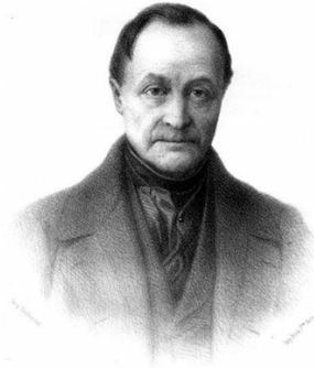
Figure 1.5 Auguste Comte played an important role in the development of sociology as a recognized discipline.