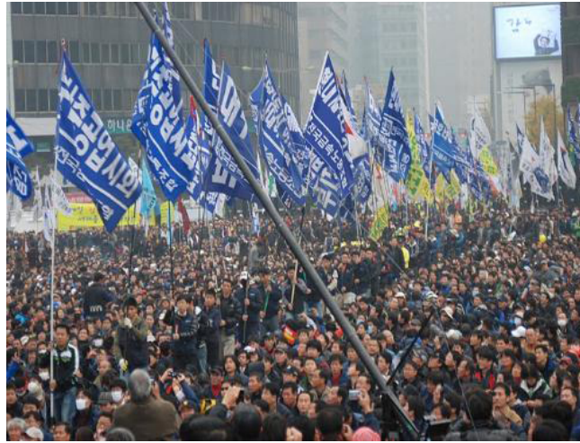
Figure 1.7 Sociologists develop theories to explain social occurrences such as protest rallies.

Sociologists study social events, interactions, and patterns, and they develop a theory in an attempt to explain why things work as they do. In sociology, a theory is a way to explain different aspects of social interactions and to create a testable proposition, called a hypothesis , about society (Allan 2006).