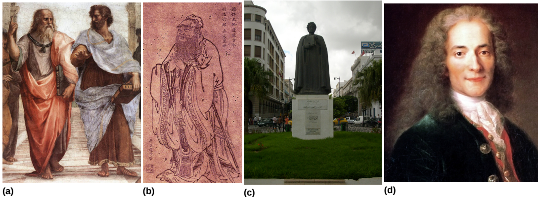
Figure 1.4 People have been thinking like sociologists long before sociology became a separate academic discipline: Plato and Aristotle, Confucius, Khaldun, and Voltaire all set the stage for modern sociology.

Since ancient times, people have been fascinated by the relationship between individuals and the societies to which they belong. Many topics studied in modern sociology were also studied by ancient philosophers in their desire to describe an ideal society, including theories of social conflict, economics, social cohesion, and power (Hannoun 2003).